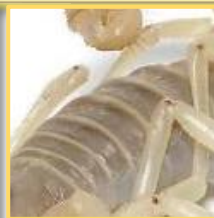
Hadrurus Arizonensis Pallidus